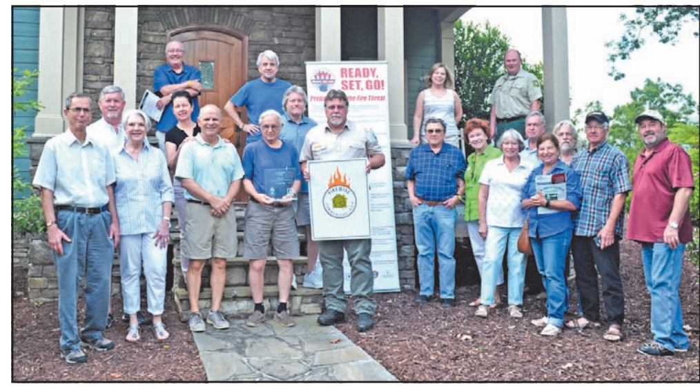
The folks on Flat Rock Ridge Road are Firewise.